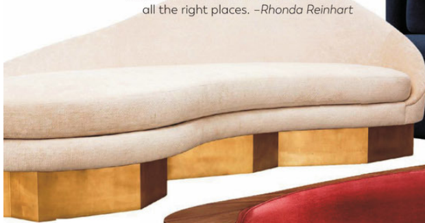
Satine sofa, from $27,150, shinebysho.com

The season's sexiest sofas have curves in all the right places. —Rhonda Reinhart