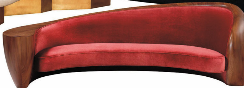
Sofa P13, to the trade, by Vladimir Kagan for HOLLY HUNT at HOLLY HUNT, 222 W. Merchandise Mart Plaza, Ste. 1428, hollyhunt.com