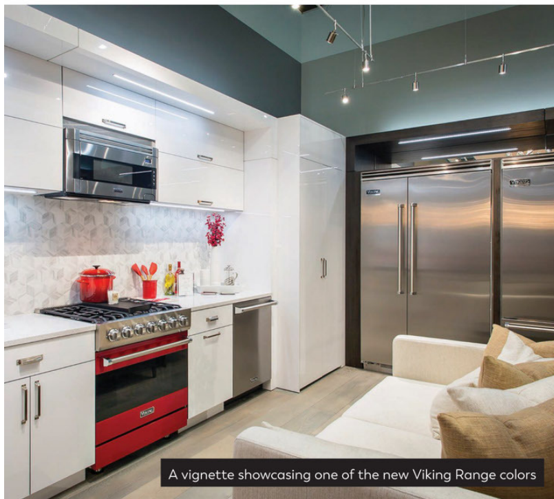
A vignette showcasing one of the new Viking Range colors