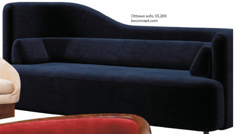
Ottawa sofa, $3,269, boconcept.com